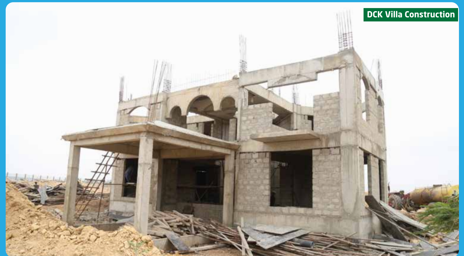
DCK Villa Construction