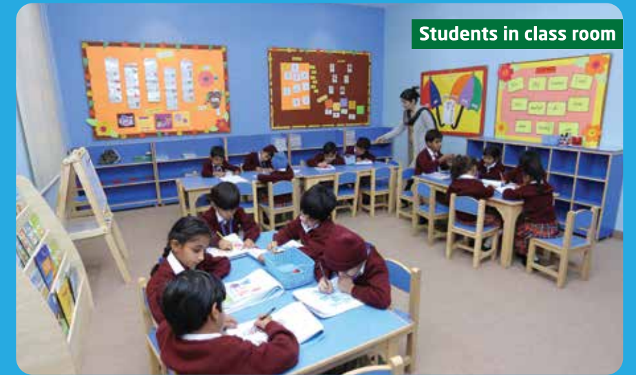
Students in class room