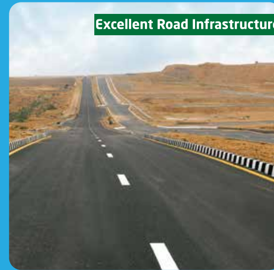
Excellent Road Infrastructure