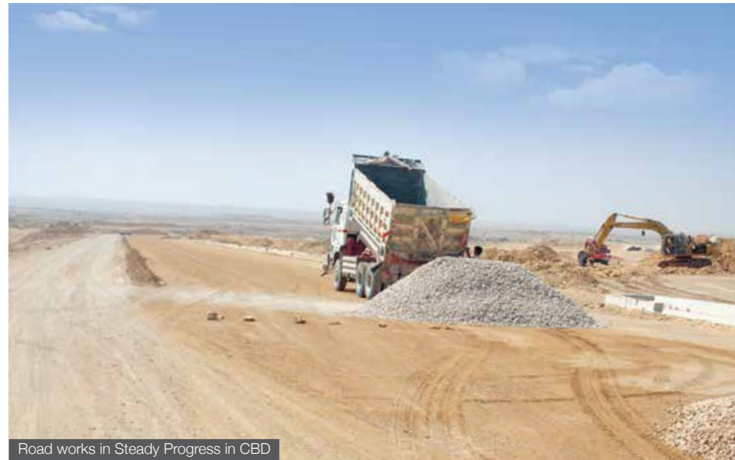
Road works in Steady Progress in CBD