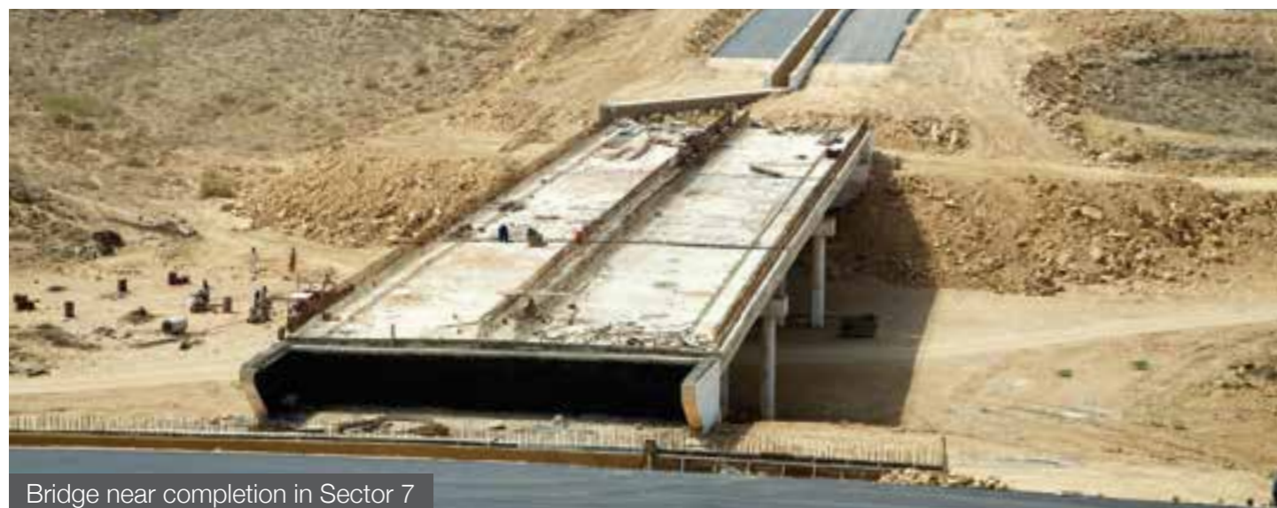
Bridge near completion in Sector 7