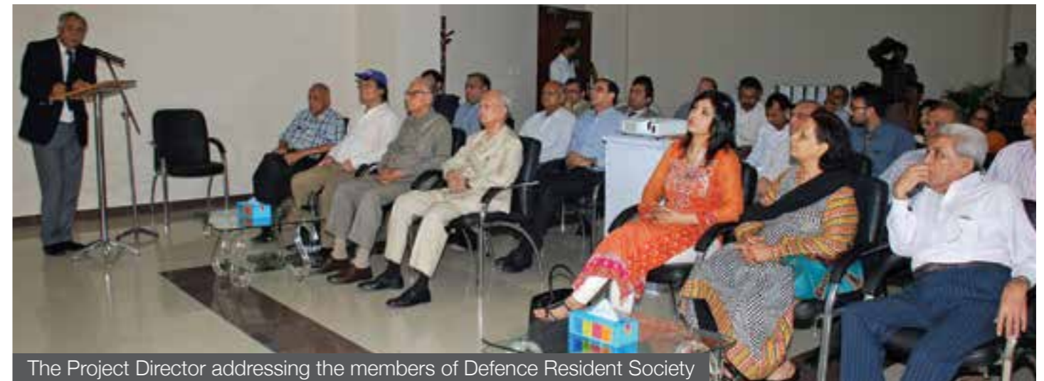
The Project Director addressing the members of Defence Resident Society