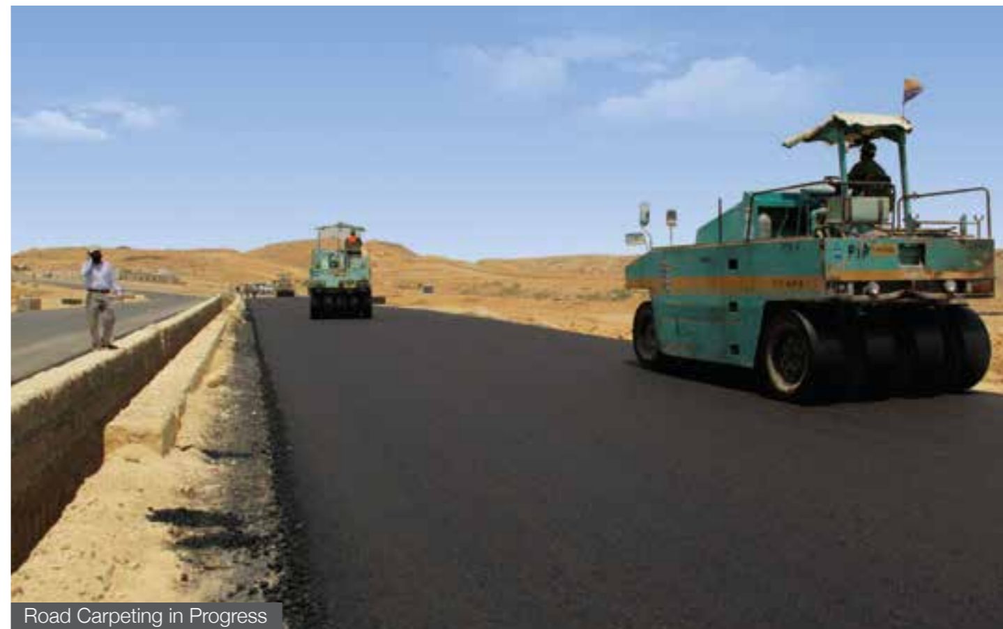
Road Carpeting in Progress