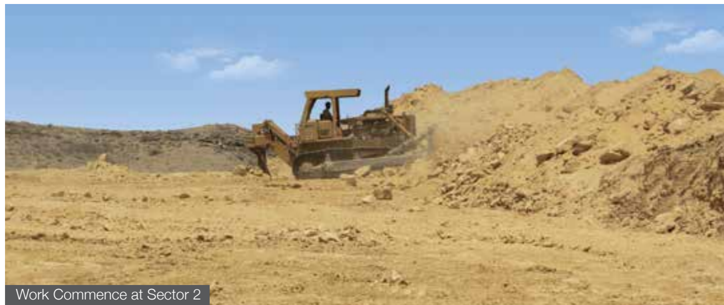
Work Commence at Sector 2