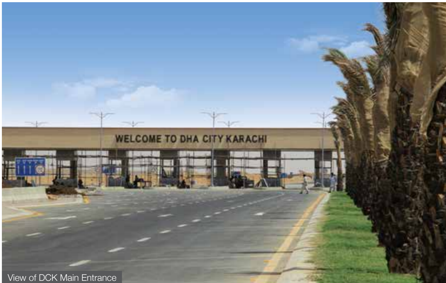
View of DCK Main Entrance