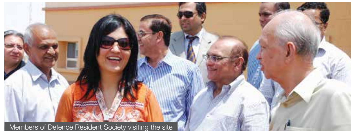
Members of Defence Resident Society visiting the site