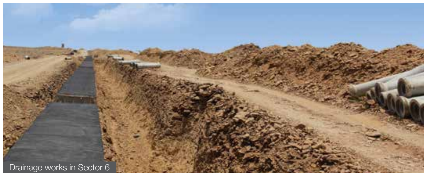
Drainage works in Sector 6