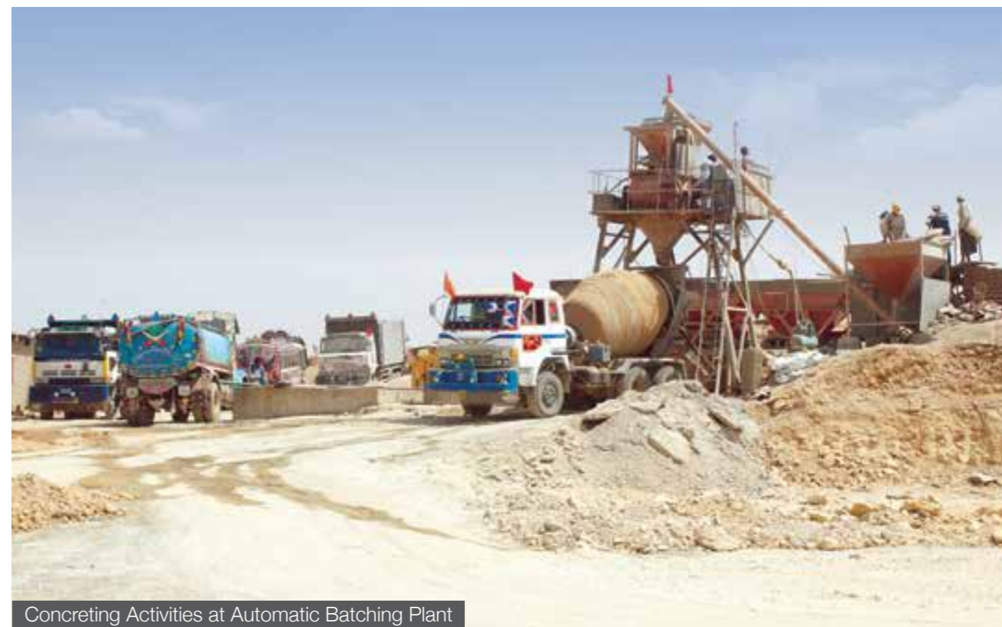
Concreting Activities at Automatic Batching Plant