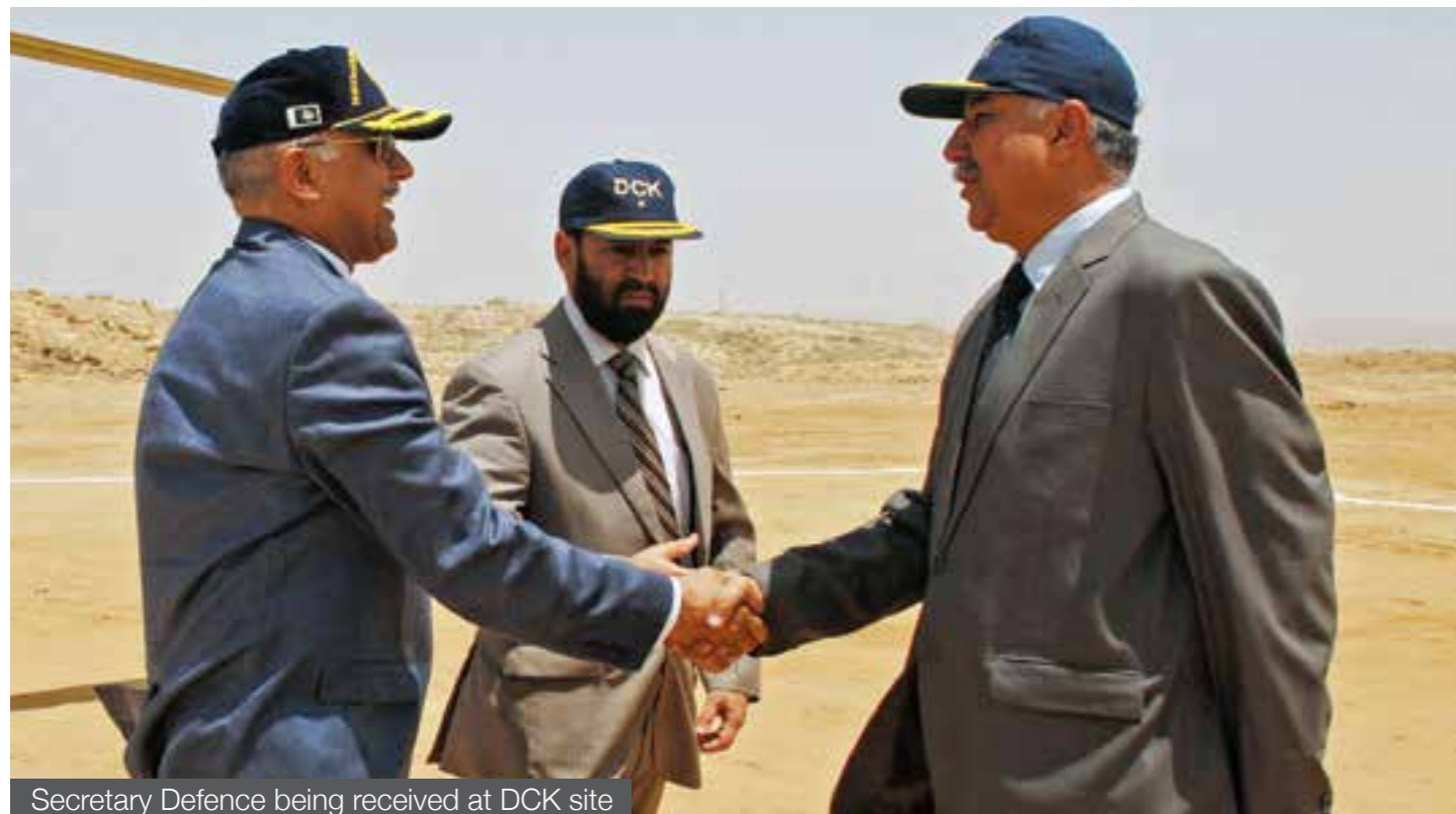
Secretary Defence being received at DCK site