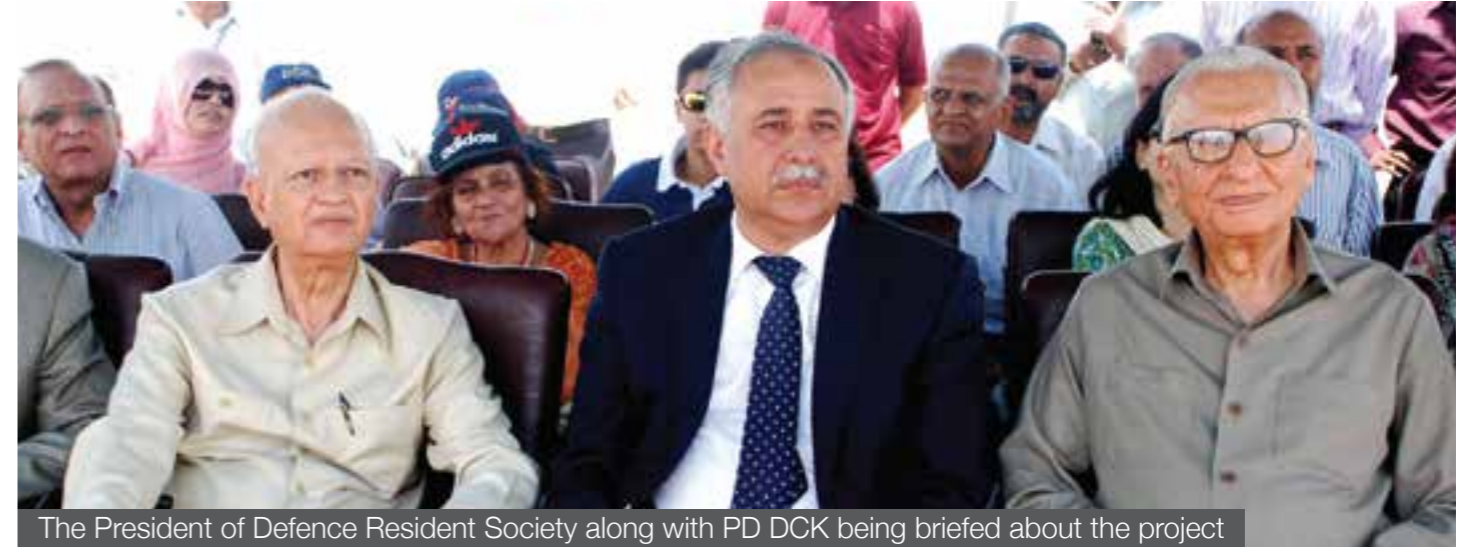
The President of Defence Resident Society along with PD DCK being briefed about the project

Defence Resident Society visited DHA City Karachi (DCK) on 19th April, 2014. They were in awe of the fast-paced development progress. The response was overwhelming.