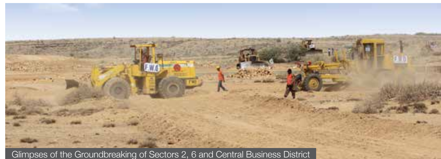
Glimpses of the Groundbreaking of Sectors 2, 6 and Central Business District