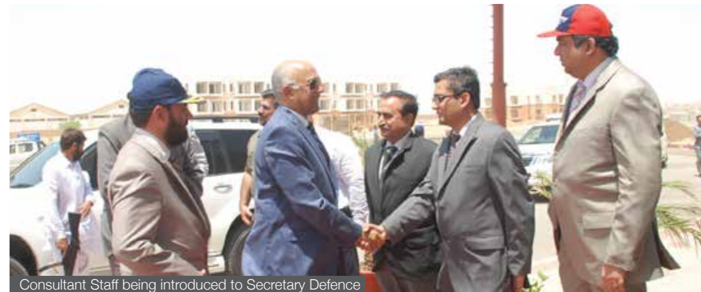
Consultant Staff being introduced to Secretary Defence