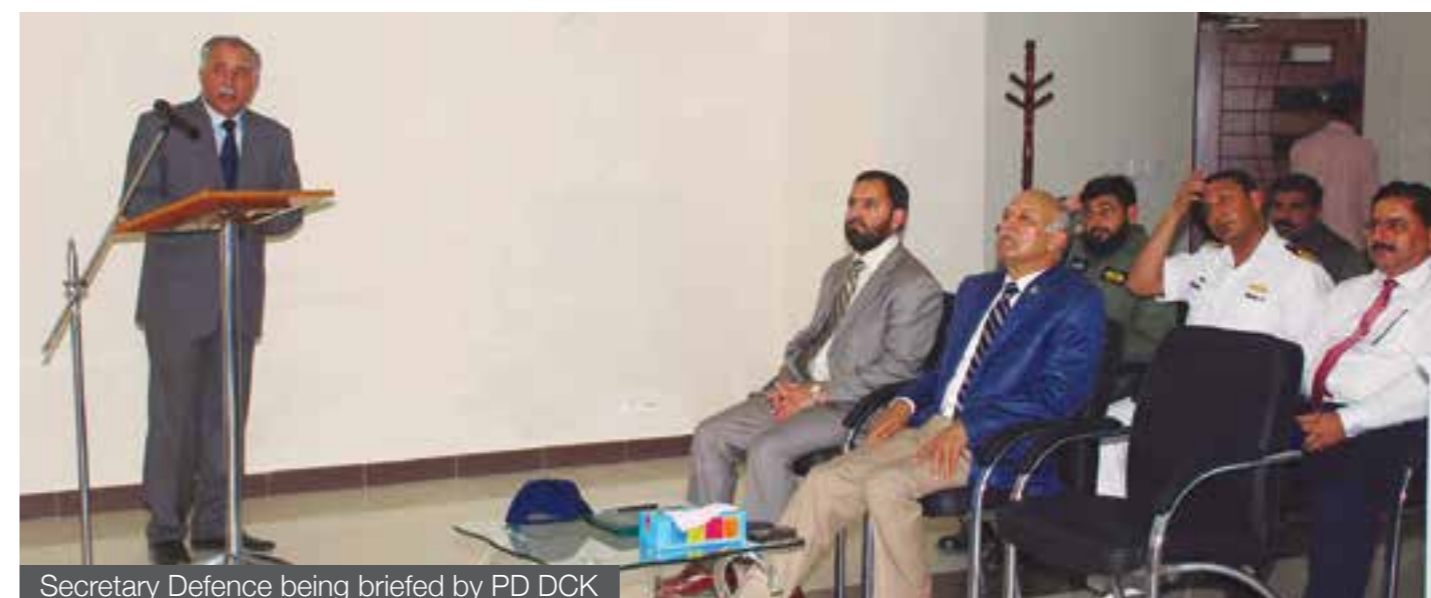
Secretary Defence being briefed by PD DCK