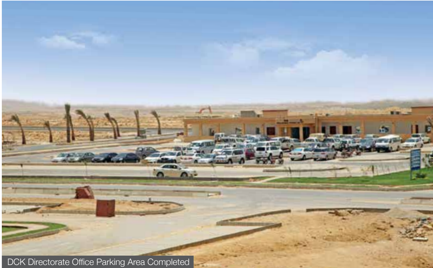
DCK Directorate Office Parking Area Completed