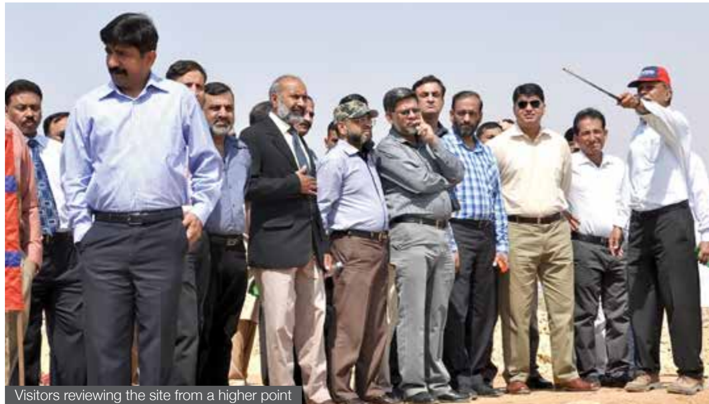
Visitors reviewing the site from a higher point