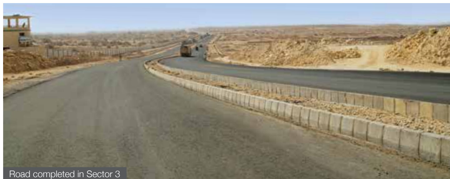
Road completed in Sector 3