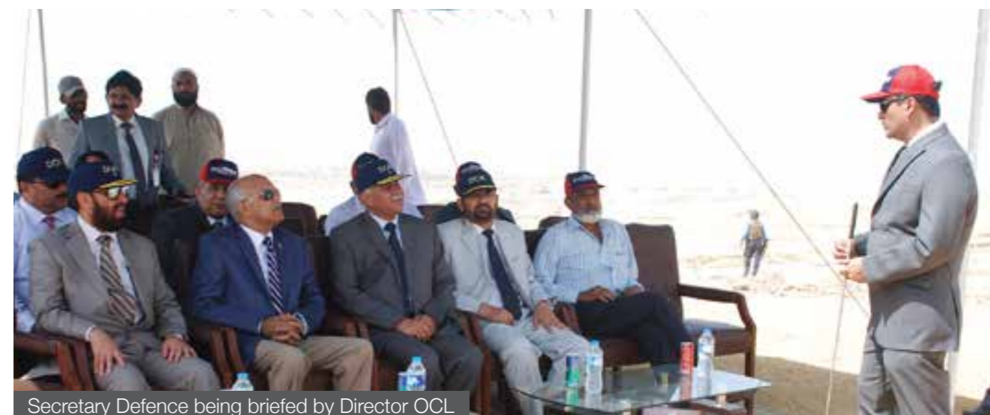
Secretary Defence being briefed by Director OCL