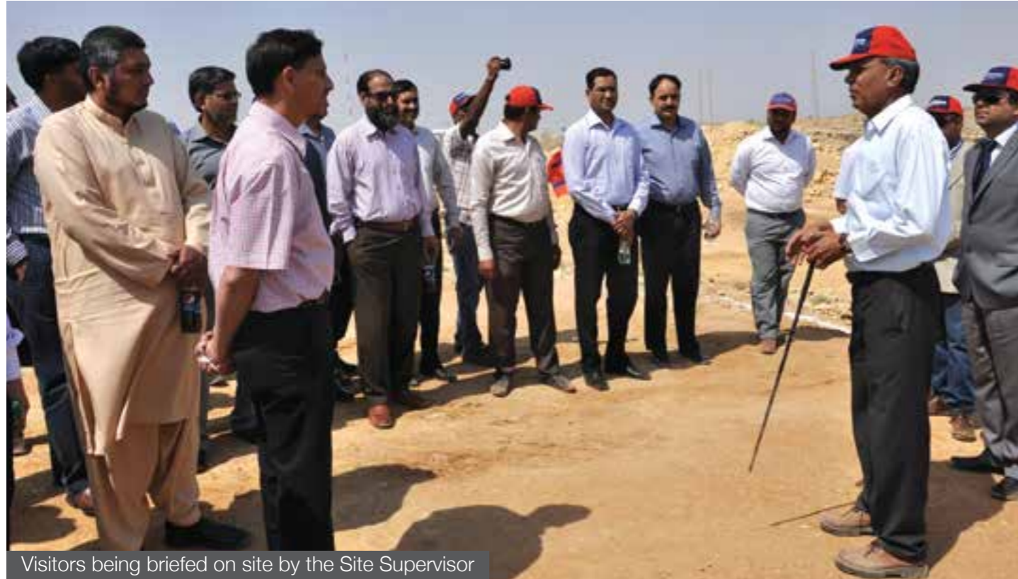
Visitors being briefed on site by the Site Supervisor

Armed Forces Officers visited DHA City Karachi (DCK) on 6th March, 2014. They were briefed upon the status of the on-going projects at DCK and were very pleased with the progress.