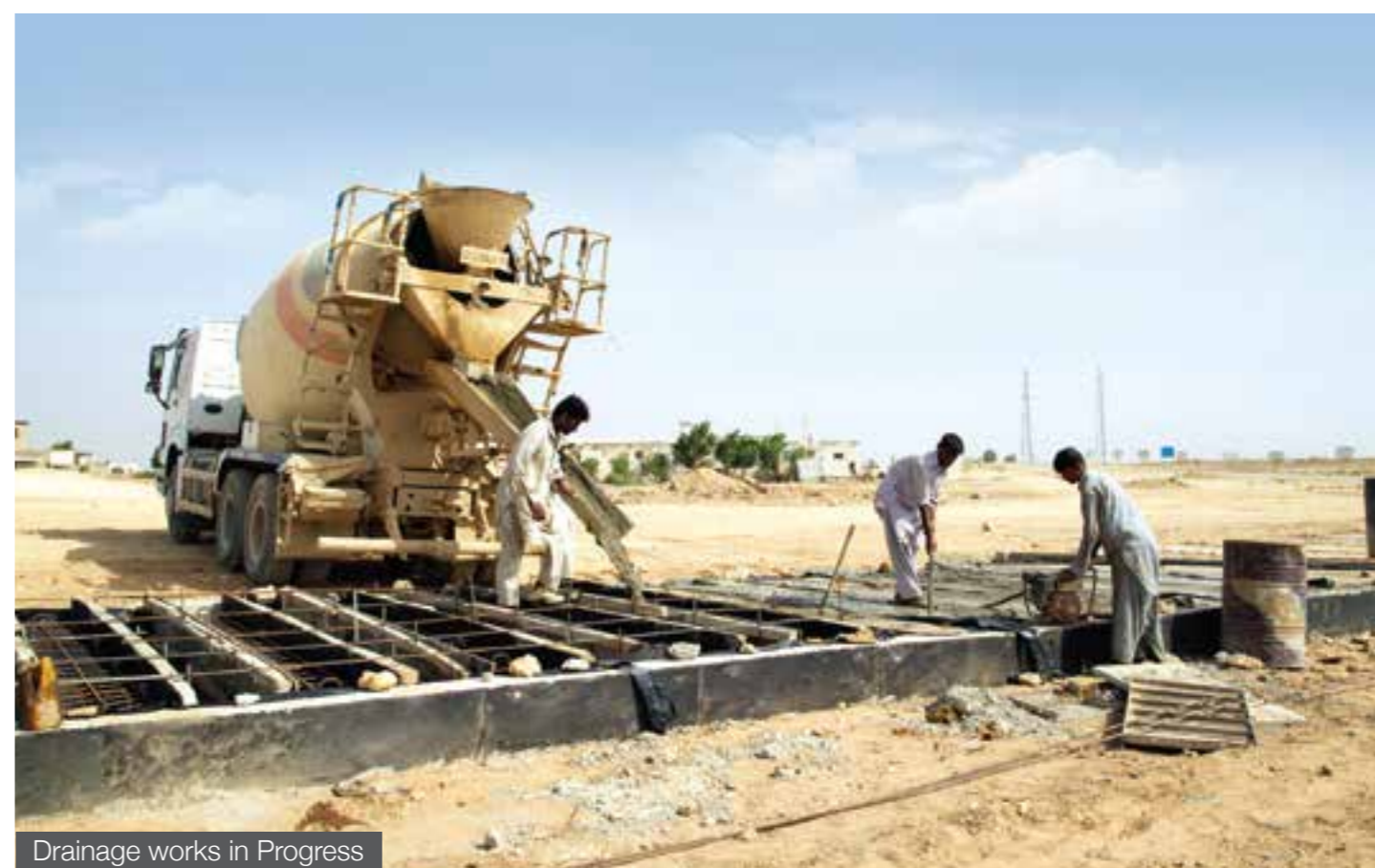
Drainage works in Progress