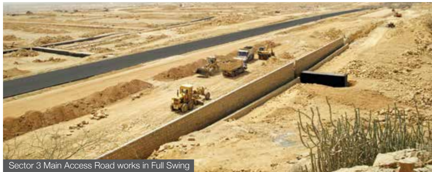
Sector 3 Main Access Road works in Full Swing