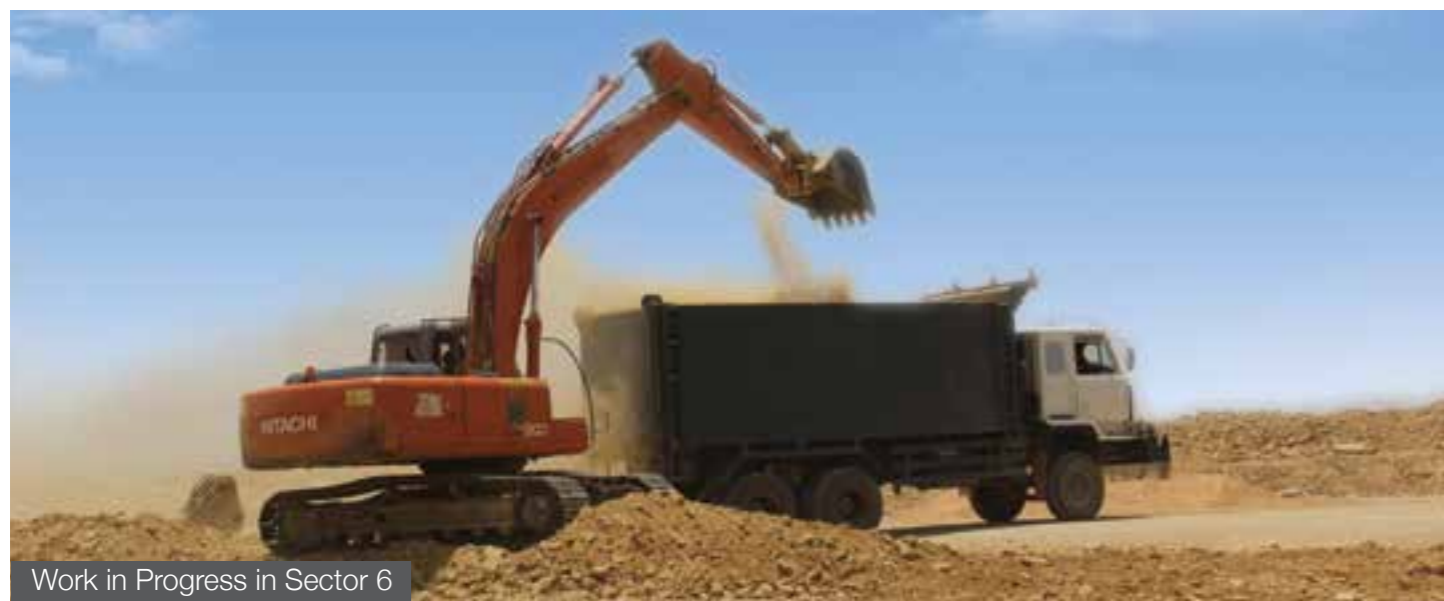
Work in Progress in Sector 6