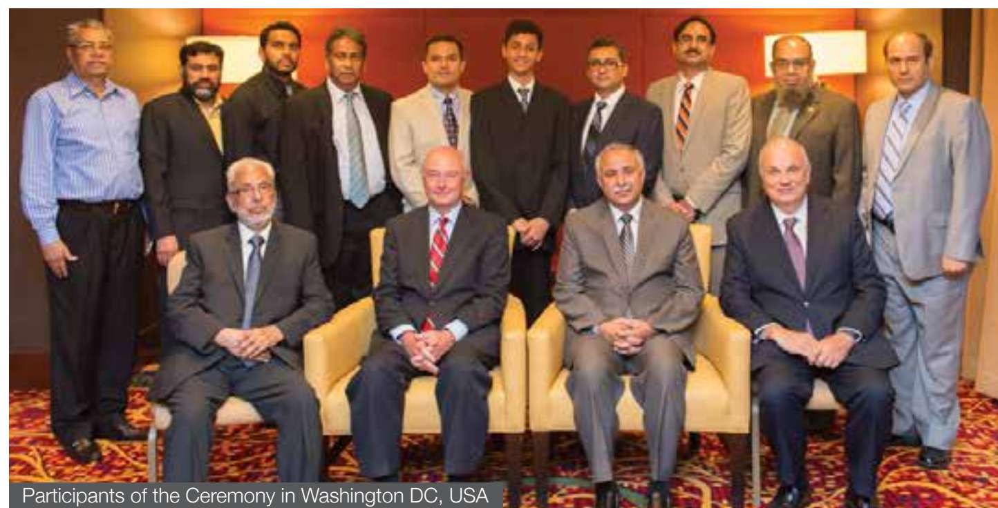
Participants of the Ceremony in Washington DC, USA